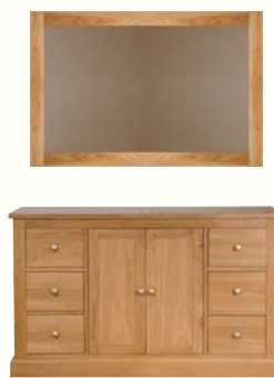
Large Sideboard HAR 040 w1370xh850xd425