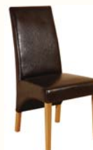
Leather Chair (Brown) HAR 550