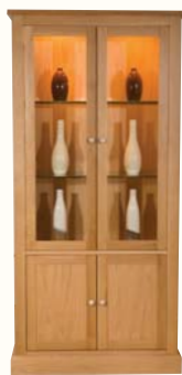
2 Door Display HAR 025 w900xh1900xd360