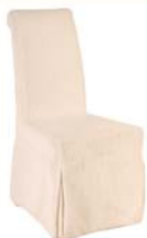
Fabric Chair (Dressed) MOR 590