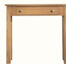
Console Table* HAR 8102 w900xh850xd300