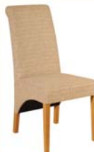
Weave Fabric Chair HAR 560