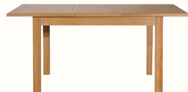
Extending Table* HAR 426 w1200-1600xh760xd900