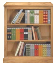
Small Bookcase HAR 112 w965xh1092xd305